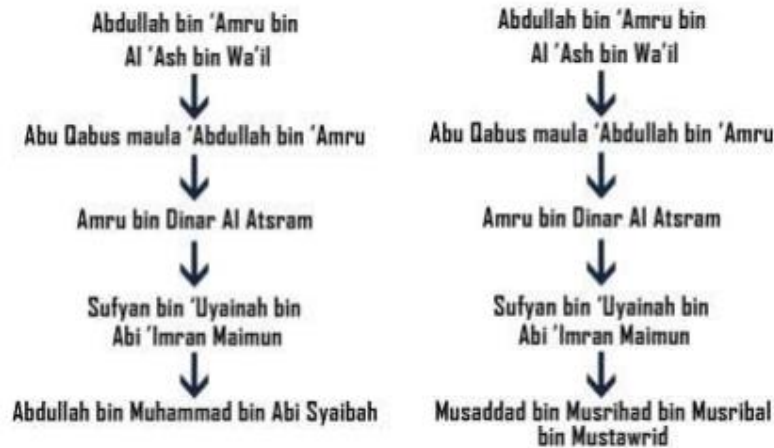
Figure 1. Hadith transmission lineage (Azizi, 2022)

From the above genealogy, the Takhrij al-Hadis and Sanad Criticism of the traditions under discussion are as follows: